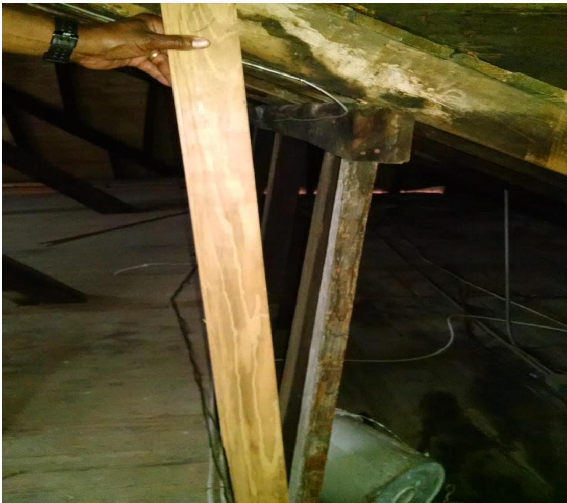
1 Interior view of roof lean

The museum is planning on a major reinterpretation of Madame John's for our visitors, and this project can only be put into place after the building is stabilized and conserved properly.