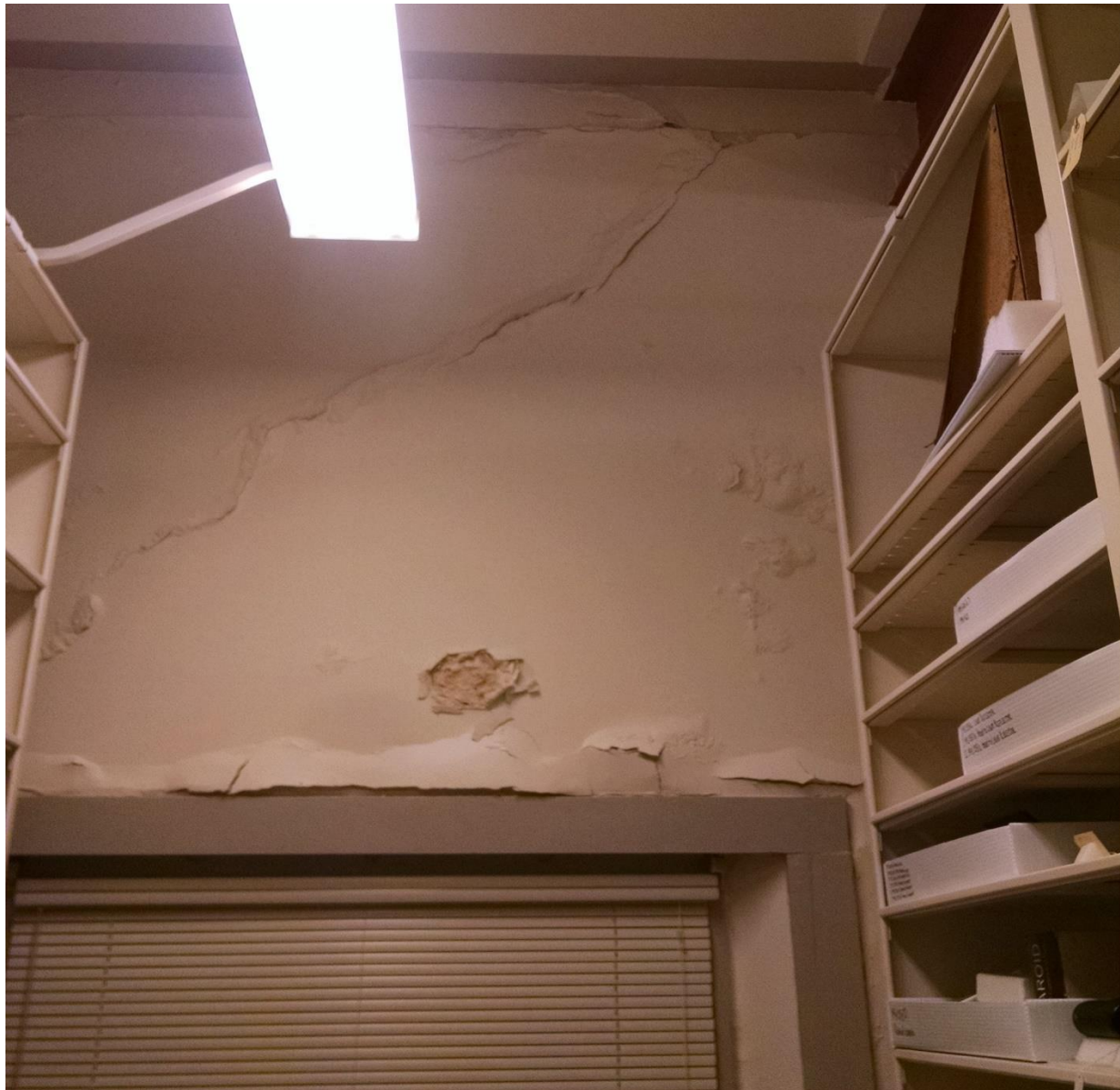
3US Mint Interior

Due to age and environmental conditions, the windows on the first and second floor need repair and water proofing. Although the gutter system is copper, the seams have leaks and are causing moisture to be trapped within the walls. This is causing the deterioration of the interior plaster within the building. Moisture that is being trapped has allowed the Formosan termite to thrive in the building in the past and there is concern for the issue returning. The termites have caused damage to the window sills and trim on the interior of the 3 rd floor.