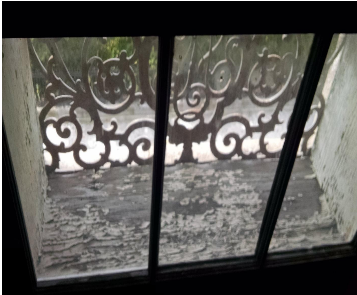
4Window from Interior

The attic windows need repair and waterproofing, further amplifying the water intrusion issues. To access the windows for repair, a wrought iron front must be removed. This project will require a lift to access the work.